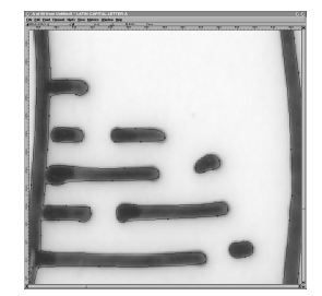
Figure 4: Close-ups of autotracer output

A more severe problem can be seen in the righthand image of figure 4. The drawings contain hardly any straight lines. For a font of this complexity, it turned out to be absolutely necessary to simplify the curves. Without simplification, the rendering speed in PDF browsers became unbearably slow. All of the near-horizontal stripes in the bellies were manually removed and replaced by geometric straight lines.