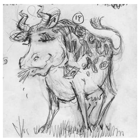
Figure 1: The first drawing

At TUG 2003 in Hawaii, Hans Hagen met with Duane Bibby. Hans was looking for some small images to enliven the ConT<sub>E</sub>Xt manuals and Wiki. A cutout of a very early sketch can be seen in figure 1, but it was soon agreed that consecutive drawings were going to be an alphabet.